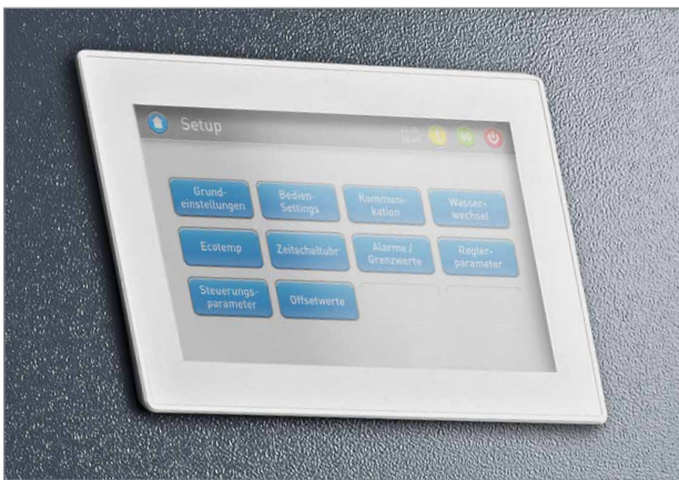
Optional SCT controller with 7" touch screen